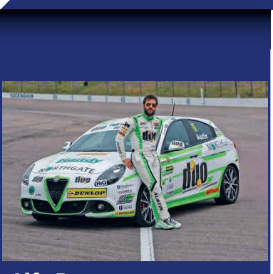
Alfa Romeo returns to BTCC with T H WHITE