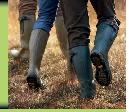
MAKE A SPLASH! Huge wellie selection choose your style!