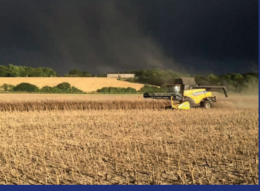
Winning harvest photo