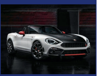
The roadster with a sting in its tail