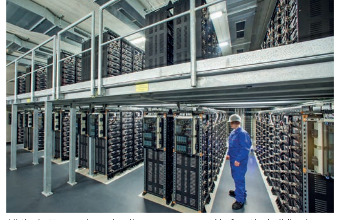
All the battery racks and walkways are removed before the building is handed to the land owner at the end of the 25 year lease.

The majority of farm sites and many industrial sites will qualify. It's a plus if the area is likely to have grid capacity due to fewer other large scale renewable projects in the area (AONB, National Park etc) and good access from the highway is a benefit. More important is the area of the country in which the site is located; Sadly Cornwall, Devon and