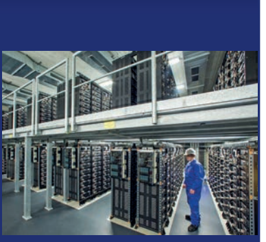
Energy Barns: a new opportunity